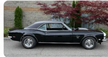
Passenger Side View