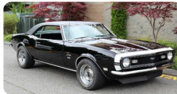
Front ¼ Passenger Side