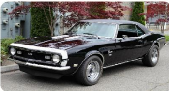
Front ¼ Driver Side