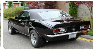
Rear ¼ Driver Side