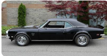
Driver Side View