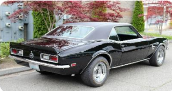
Rear ¼ Passenger Side